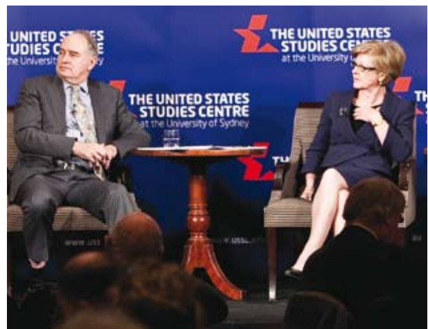
Ross Garnaut and Gillian Triggs