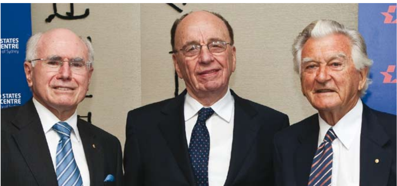
John Howard, Rupert Murdoch and Bob Hawke