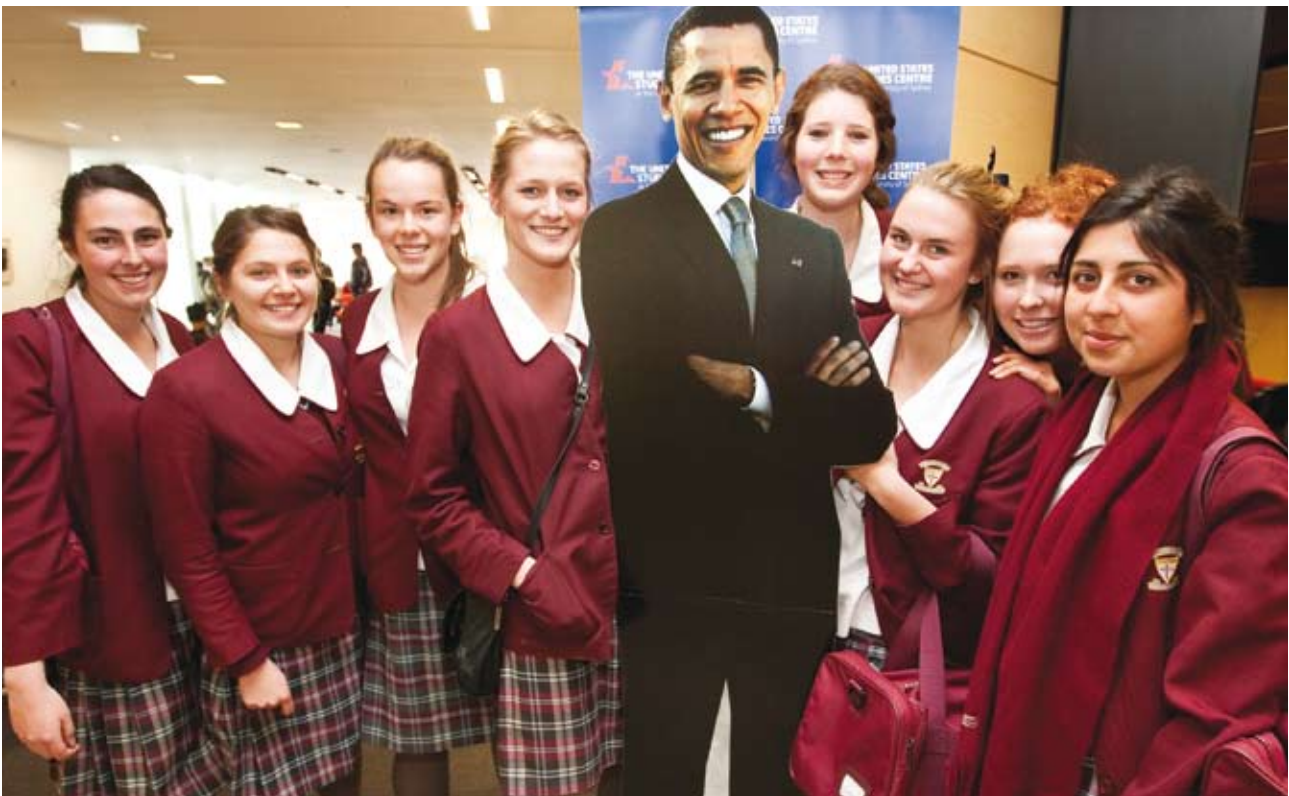
High school students

The Centre also developed an innovative class, "America: Heroes, Rebels and Renegades" that will give high school students credit towards University of Sydney degrees before they enrol. Approved by the New South Wales Board of Studies, the course has been developed to appeal to high school students with an interest in the US and a willingness to embark on university-level studies. In 2011 it will introduce Year 11 students to the complexity and diversity of the United States in both a contemporary and historical context by focusing on celebrated individuals.