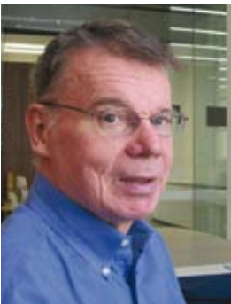
Colin Campbell Visiting Professor