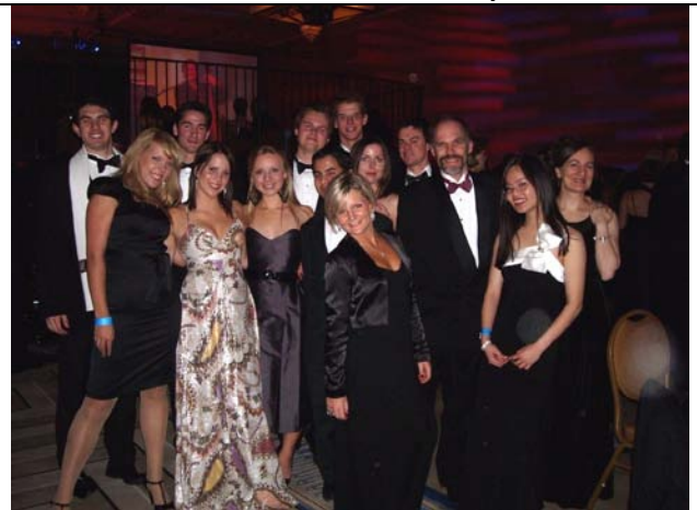
UCWIP 2009 attended the Texas State Society "Black Tie and Boots" Inaugural Ball on January 19, 2009.