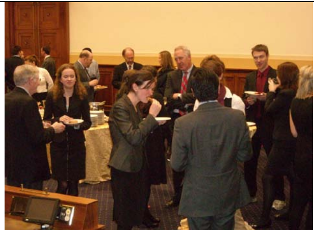
A glimpse of the gathering, which included Members of Congress, State Department officials, Australian Embassy officials, a former US Ambassador, and scores of congressional staff.